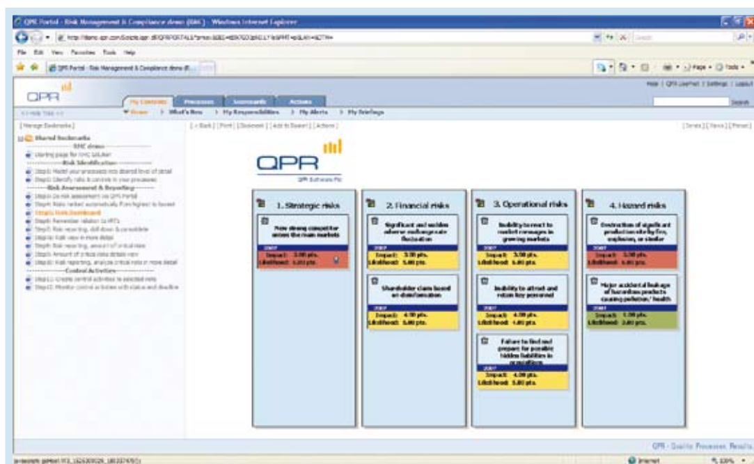
Role-based risk management dashboards

The QPR Risk Management and Compliance solution provides managers and the board with an effective means of getting an up-to-date overview on the status of risks and controls with role-based risk management dashboards. Examples include dashboards that focus on SOX compliance, production risks, environmental risks, risks related to a particular business unit. Management teams thus obtain their high-level views into the risk and compliance status, while functional managers know exactly what they are accountable for and get alerted whenever there is a problem. On top of that, the monitoring functionality provides all the features required for doing analysis, drilling down to lower levels of the risk measurement framework as well as filtering of risk metrics. Your organization as a whole obtains the ability to react fast to problems or opportunities as well as the confidence that everything is under control.