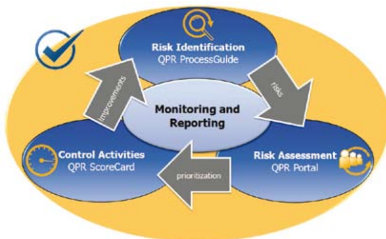
The QPR Risk Management and Compliance Lifecycle

The QPR Risk Management and Compliance Solution covers all phases of the risk and compliance management process by providing an effective and unified means for identifying and assessing risks on an enterprise-wide scale, consolidating risk assessments, implementing controls as well as continuous monitoring and reporting.